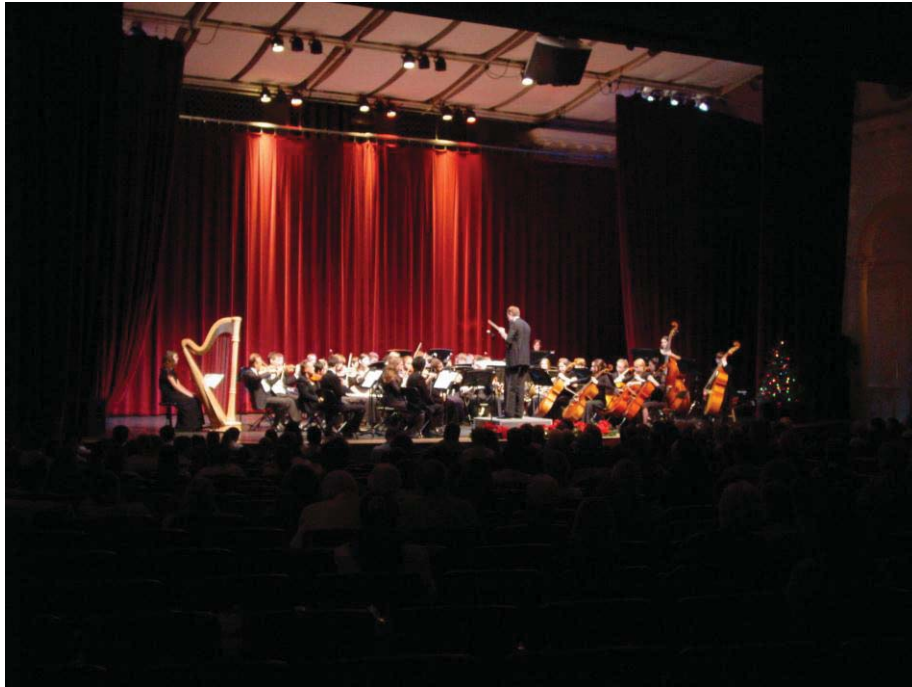
Side Door Cabaret